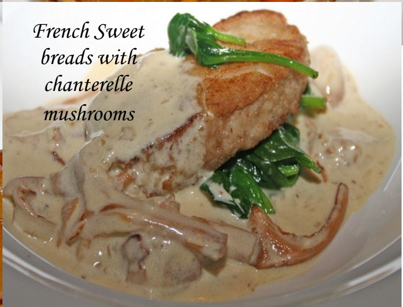
French Sweet breads with chanterelle mushrooms