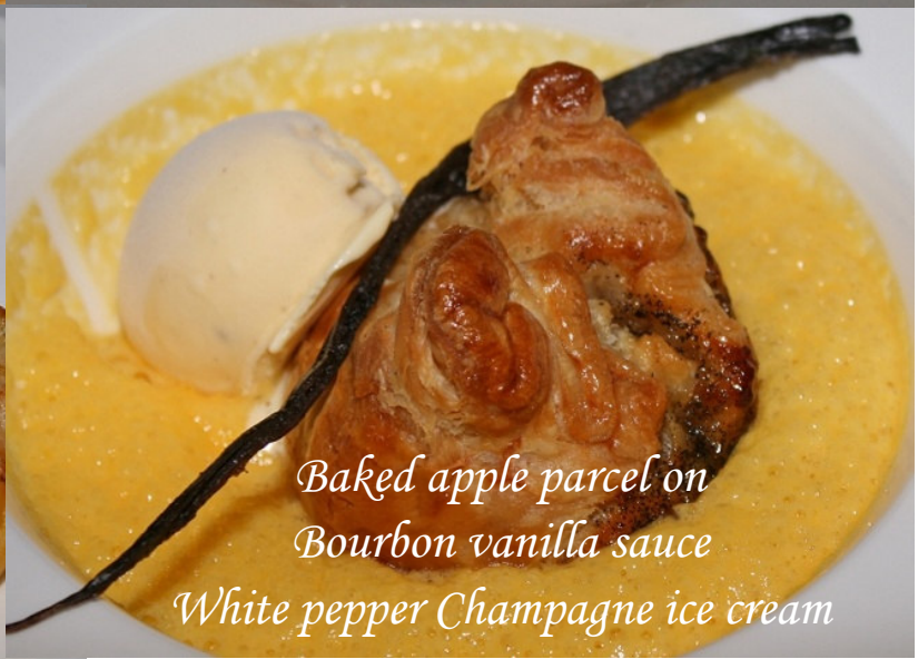
Baked apple parcel on Bourbon vanilla sauce White pepper Champagne ice cream