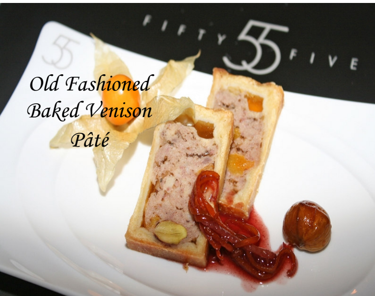
Old Fashioned Baked Venison Pâté