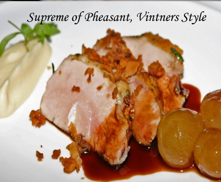
Supreme of Pheasant, Vintners Style