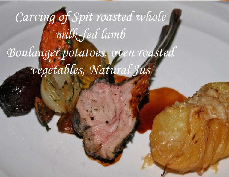
Carving of Spit roasted whole milk-fed lamb Boulangier potatoes, oven roasted vegetables, Natural Jus