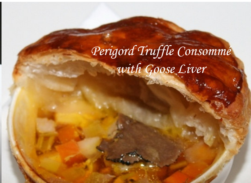
Perigord Truffle Consommé with Goose Liver